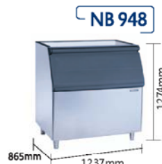
Storage Capacity: 406kg