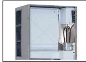
Vertical Cube System