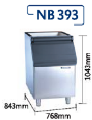
Storage Capacity: 178kg