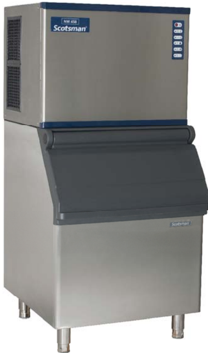
Shown on NB393 bin