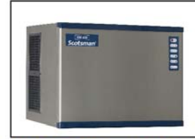
T304 Stainless Steel Panels