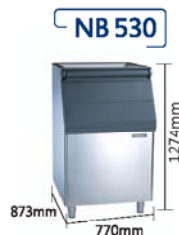
Storage Capacity: 243kg