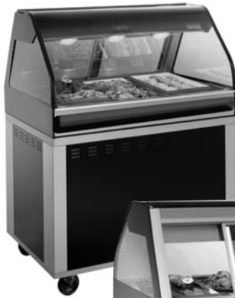
EU2SYS-48 FRONT VIEW SHOWN WITH OPTIONAL CASTERS