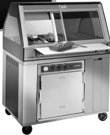
EU2SYS-48 BACK VIEW SHOWN WITH 750-TH-II COOK & HOLD OVEN AND OPTIONAL CASTERS