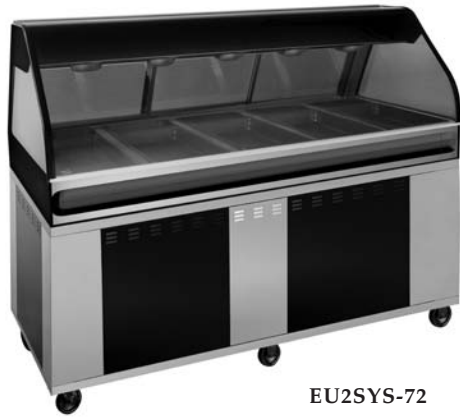
EU2SYS-72 FRONT VIEW SHOWN WITH OPTIONAL CASTERS