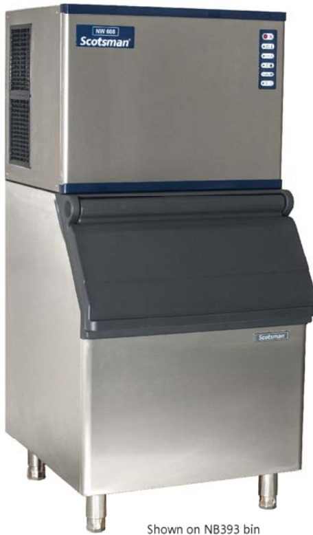
Shown on NB393 bin