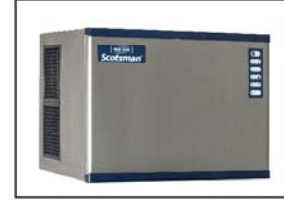
T304 Stainless Steel Panels