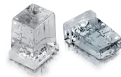
Dice Cube - 12g (23 x 23 x 26 mm) Half Dice Cube - 6g (11 x 23 x 26 mm)