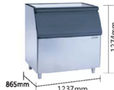
Storage Capacity: 406kg