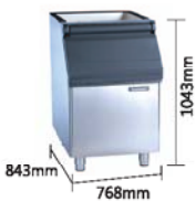
Storage Capacity: 178kg