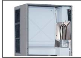
Vertical Cube System