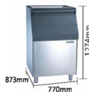
Storage Capacity: 243kg