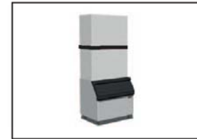
Double Stack (Needs a stacking kit sold separately)