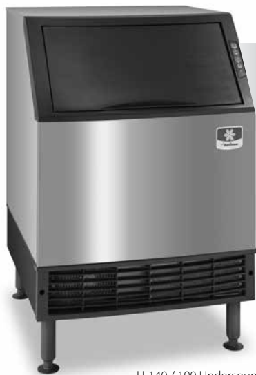
U-140 / 190 Undercounter Ice Machine