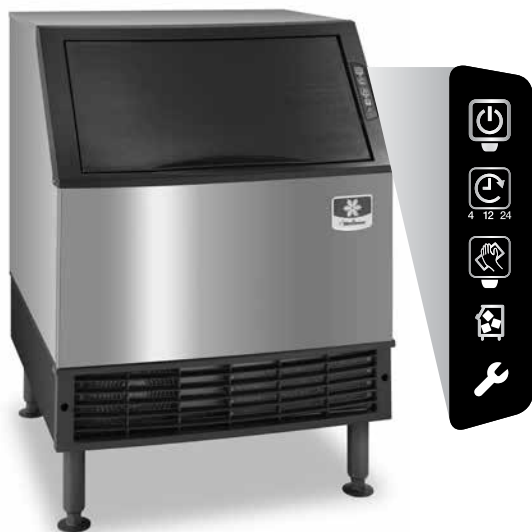
U-310 Undercounter Ice Machine